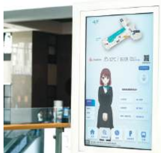
Use Case 1

A.I. Ambassador could assist the users in completing simple tasks, such as form filling, visitor registration, and more. Capable of showing a directory and live chat routing, the ambassador will be your next-generation unmanned concierge.