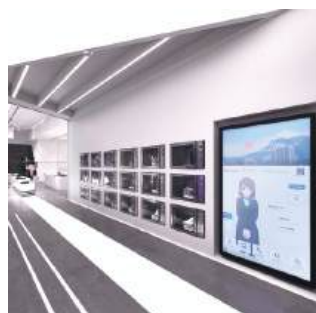
Use Case 4

Integrating with IoT systems to act as a multi-functional property manager