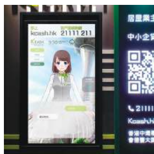
Use Case 2

Handling different customer enquiries for government enquiries for government department